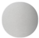
reconstructed stone X084