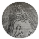
Carbonised wood X094