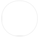
Solid surface white 3mm X035